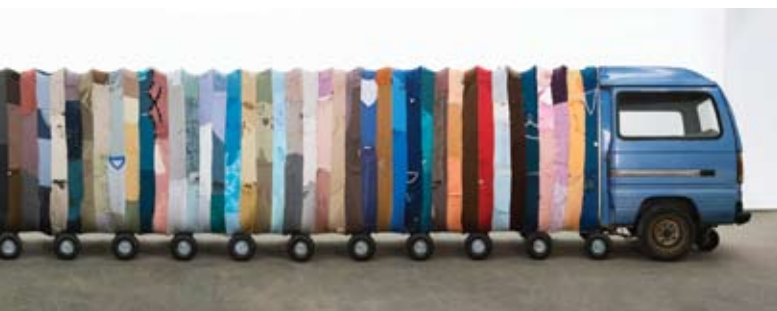
(Center) FLYING MACHINE , 2008, cloth, stainless steel, planks, 1592 x 1220 x 353 cm.