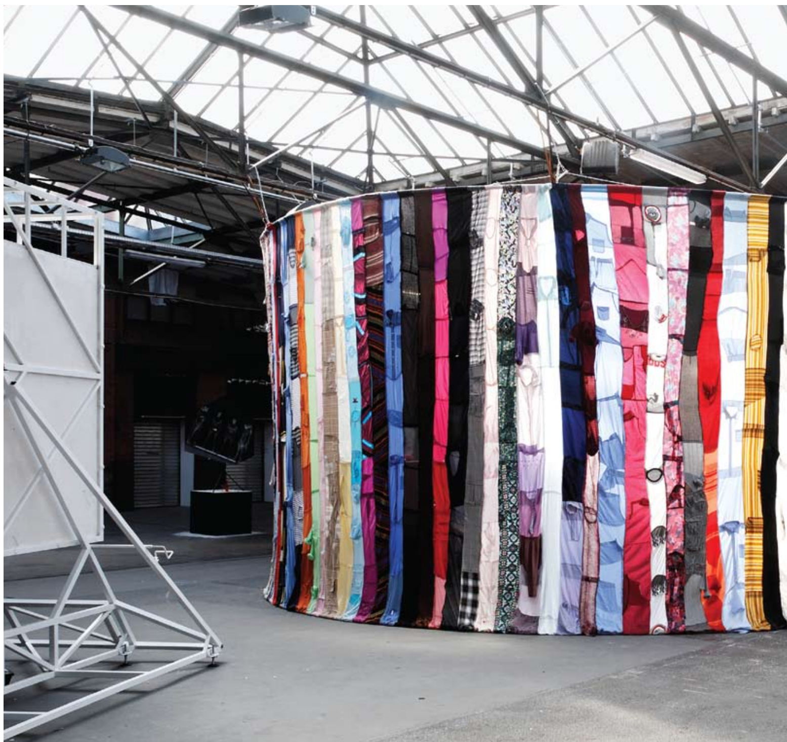
(Above) COMMUNE , 2008, fabric installation. Installation view at Alexander Ochs Galleries at ABC Berlin Contemporary, 2008.