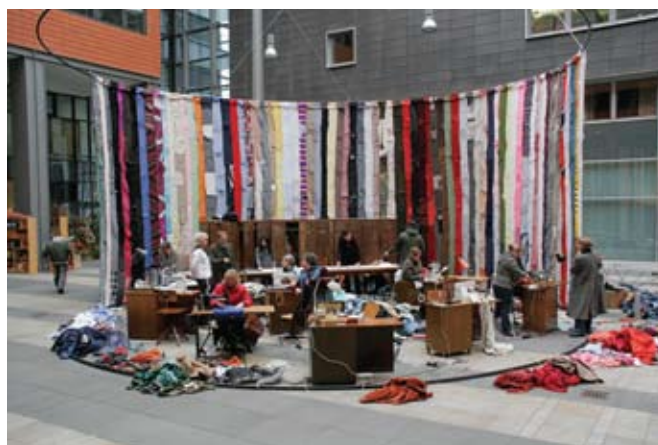
(Bottom Left) COMMUNE , 2008. Installation view at Bürgerverwaltungszentrum Moritzhof, Chemnitz.